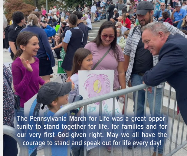
The Pennsylvania March for Life was a great opportunity to stand together for life, for families and for our very first God-given right. May we all have the courage to stand and speak out for life every day!